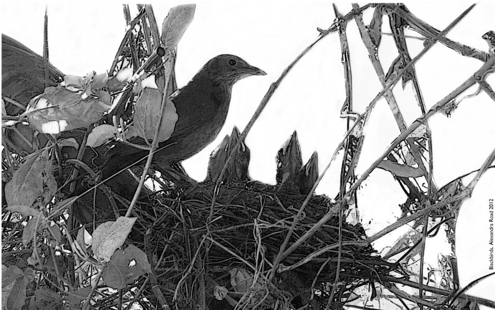
Blackbirds, Alton Road 2012 Poster design: Vicky Hirsch 2013

Live music, food, drink, stalls, children's activities, birds of prey, tree trails, crayfish traps, bug safari, worm charming, a fun dog show and much more!