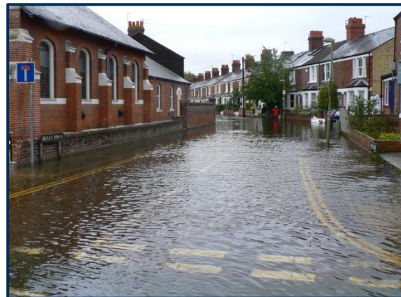
Helen Road, Oxford, flooded in 2007

Climate change projections are built into the design of flood schemes to ensure they are fit for the future. The Oxford Flood Alleviation Scheme will be effective against the scale of the largest Oxford flood in living memory - 1947. With climate change, this size of flood is expected to occur more frequently. The floods of recent decades, such as 2007 and 2014, will be seen much more often.