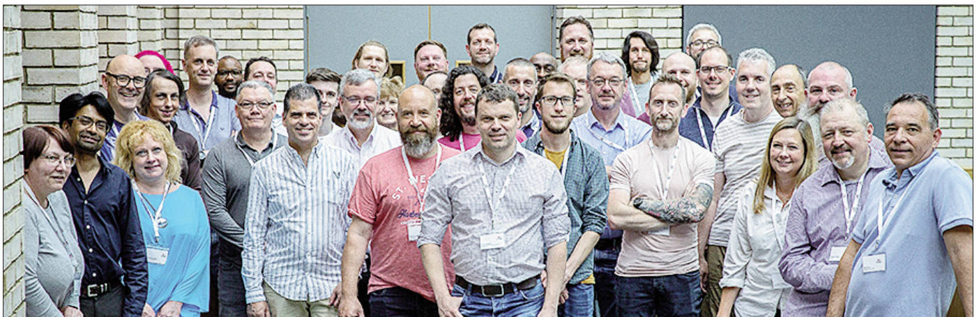
SCHOMS22 delegates outside the University of Durham's Teaching and Learning Centre