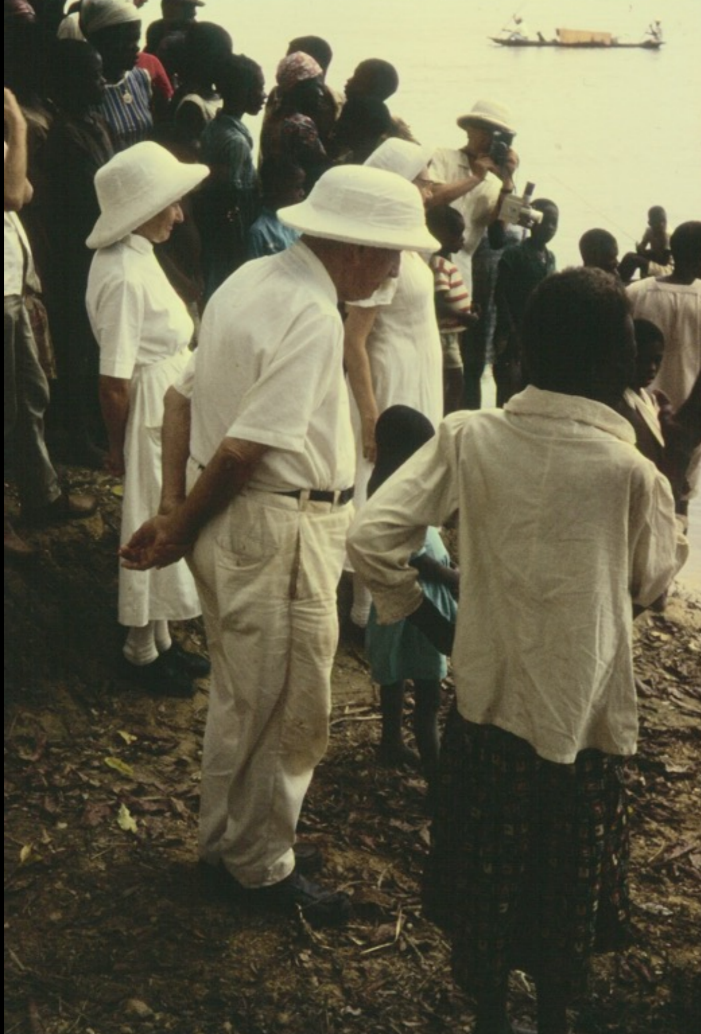
The reception party