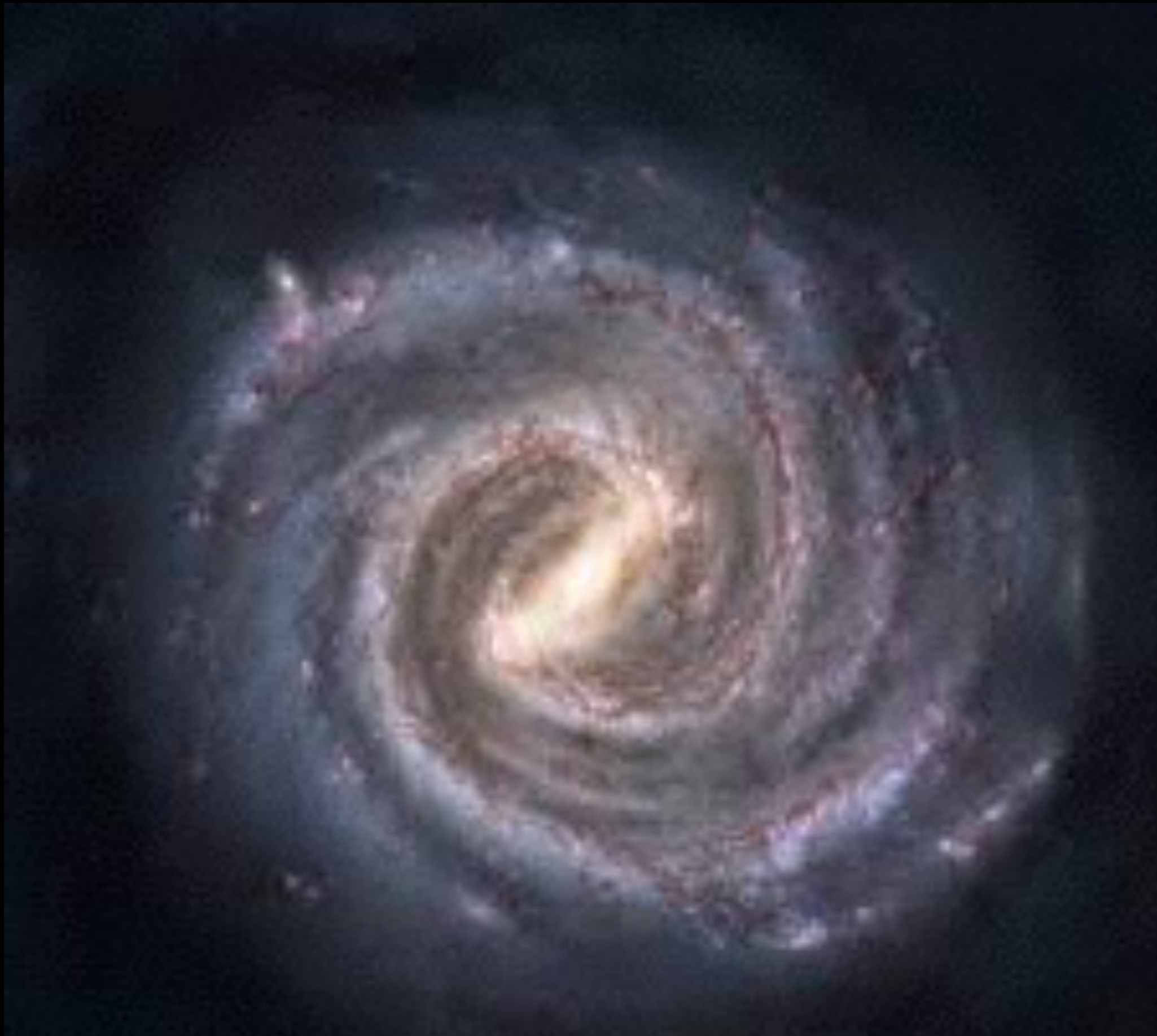
The Milky Way Galaxy