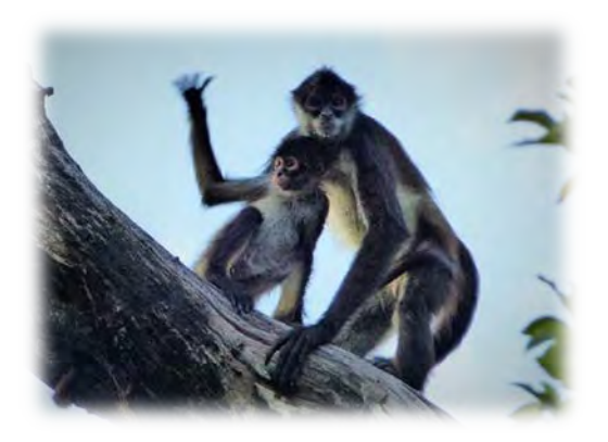
Spider monkeys live high up in the tree canopy of the tropical forests between Mexico and Bolivia. Geoffroy's spider monkey is the northernmost of them.

The complete preservation of continuous mature forest as a conservation strategy might not always be a realistic approach, especially in regions where the economic benefit of modifying natural landscapes is as great as in the inland area of the Riviera Maya. Therefore, detailed knowledge on how different types of anthropogenic disturbance impact animal populations is necessary to find ways of combining primate conservation efforts and economic interests. This study aimed to gather such detailed knowledge. Once preliminary results are confirmed, appropriate conservation strategies will be developed and recommended to ensure the viability of Geoffroy's spider monkey in the inland area of the Riviera Maya.