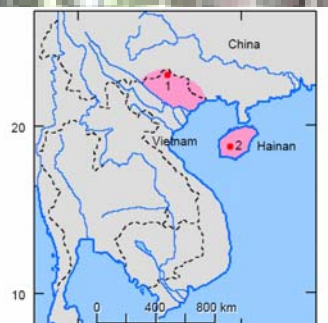
Pig. 2: Map showing current and past distribution of eastern Nomascus (crested) gibbons. Point 1: Eastern black crested gibbon N. nasutus. Around 40 remain in the wild, on the Vietnam-China (Guangxi) border. Point 2: Hainan gibbon N. hainanus. Only 20 remain today.

Changkang Changkang Dingan Wenchang Changkang Danzhou Tunehang Olonghal Dongfang Olongzhong County Town Ladong Tongta Wanning County Town Baoting 90s Tropical rainforest Sanya 30s Tropical rainforest