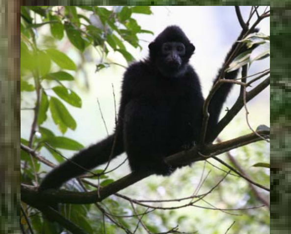
Photo 4. Male Hainan gibbon. While a number of young have been born in recent years, and up to five individuals live outside groups, no new breeding groups have been formed. Habitat suitability is one of various possible impediments.

To convert and plant more adjoining areas, some £350 per hectare is needed. A donation of just £10 would recreate a tennis-court sized area of habitat for the gibbons and thousands of other forest species. It would also send a powerful message to the people of Hainan: that their gibbons and forests have value, even to people across the world.