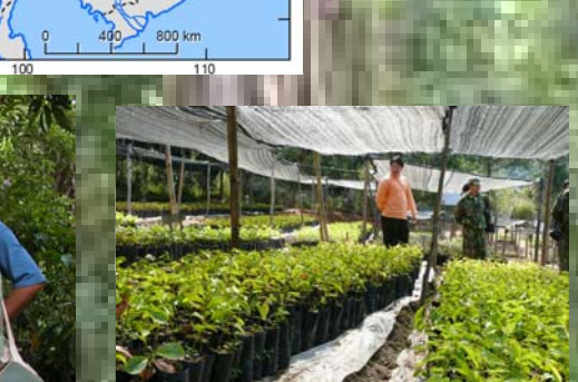
Photo 3. The Bawangling tree nursery. Some 80,000 native trees have been planted to enlarge and connect forest fragments, with thinning of pines, and in-situ seedling survival is over 80% after two years. Much more restoration work is needed.

Fig. 3. Map showing the change in Hainan gibbon distribution over the last century. Hainan gibbons are now restricted to 15 km² of continuous habitat within Bawangling National Nature Reserve (red); searches elsewhere have been unsuccessful.