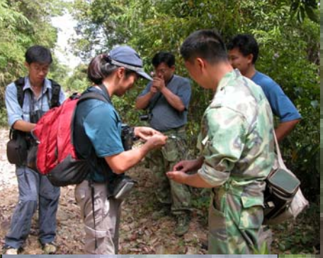
Photo 2. Ecologists from Kadoorie Farm & Botanic Garden help Bawangling reserve staff identify and collect native seeds for the tree nursery.