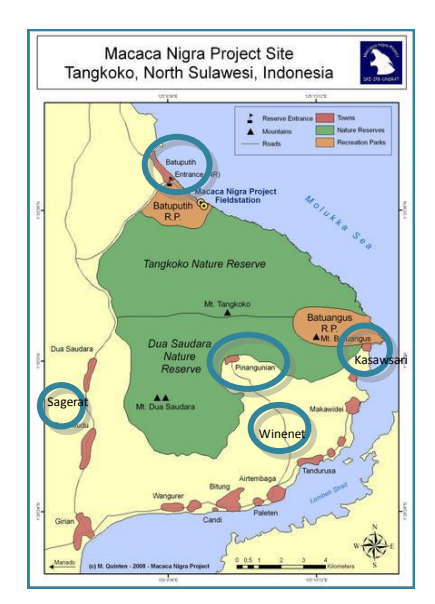
Map of the Tangkoko-Duasudara reserve and the villages involved in our programme (Map: Macaca Nigra Project)

The project started in 2011 in one village at the entrance the reserve, following by another school year project in 2011-2012 including two more villages. The Conservation Grant Award provided by PSGB has helped us to intervene during a third school year and include two additional villages for 2012-2013. So far we have worked with 7 primary schools and 4 junior schools, for a total of 330 pupils between 8 and 15 years old.