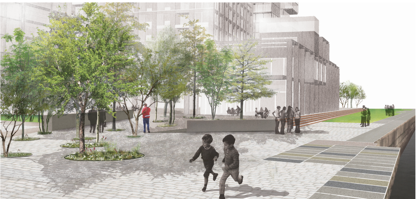
Concept illustration by DFLA from an early design stage