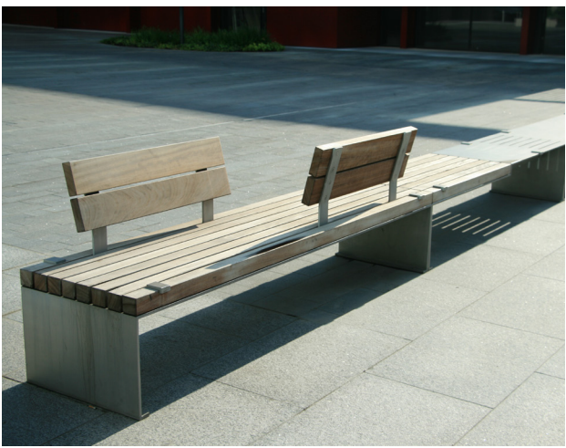
Images of completed benches in the new public plaza