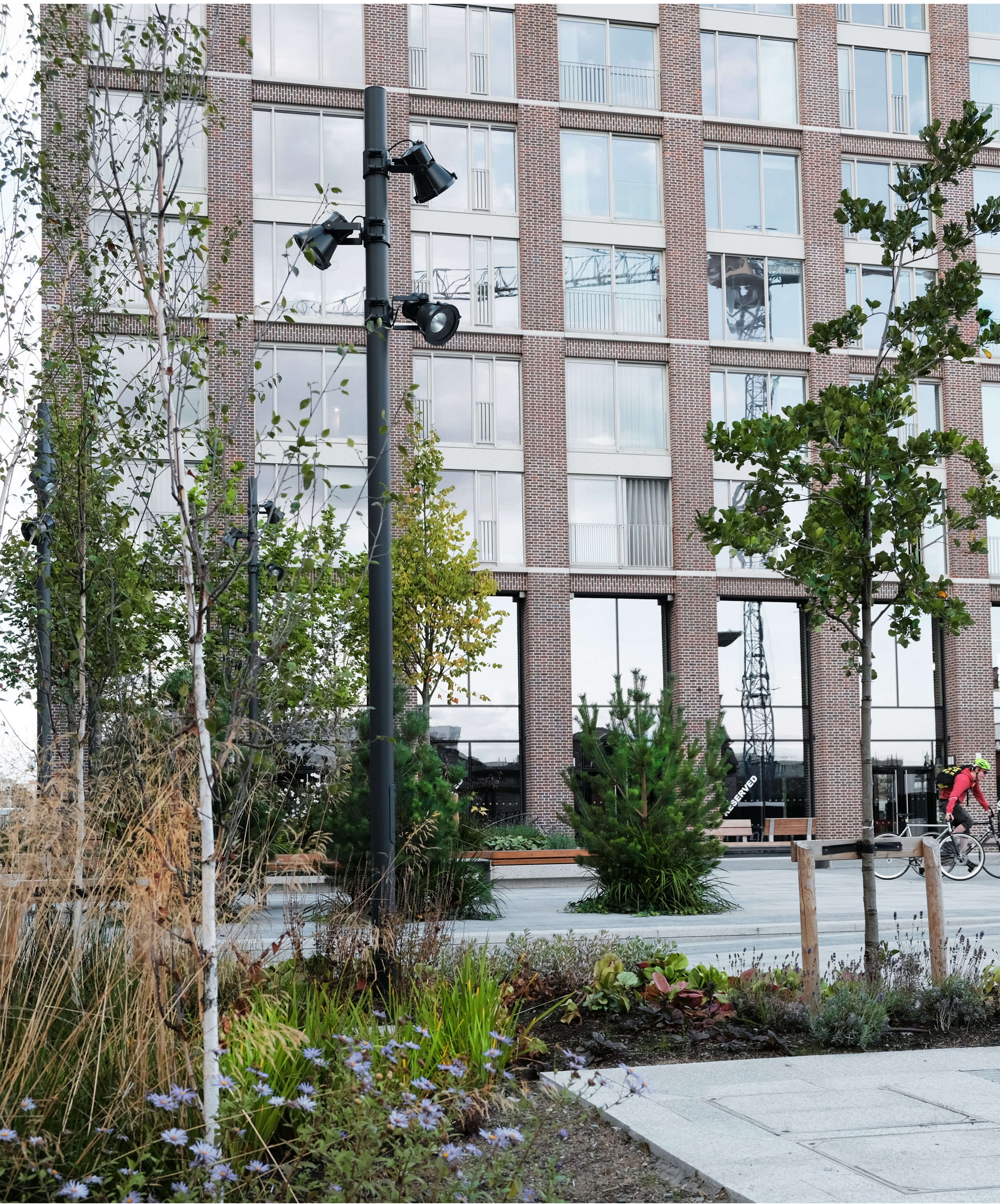
A view through planting looking at the new plaza

A unique mix-use development with a new public plaza