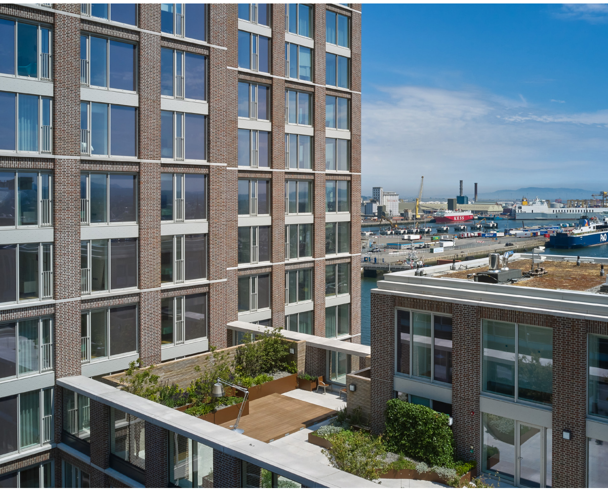
Views of roof terraces and playground from above