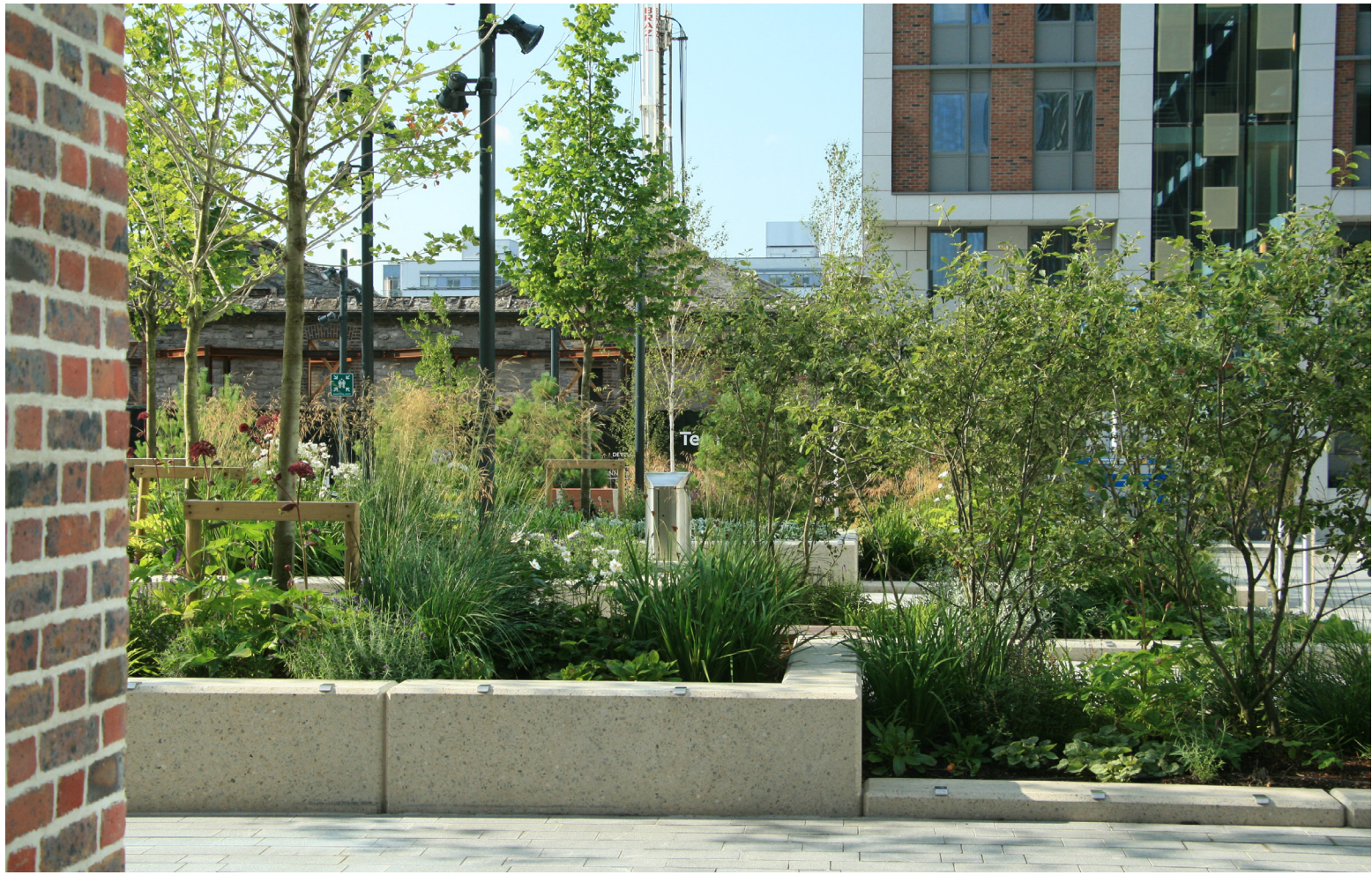
Character and atmosphere (from left to right) - view looking through the lines of planting at the plaza