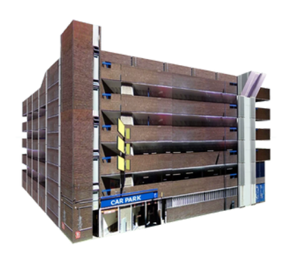
A car park

Circle where you should go to the toilet.