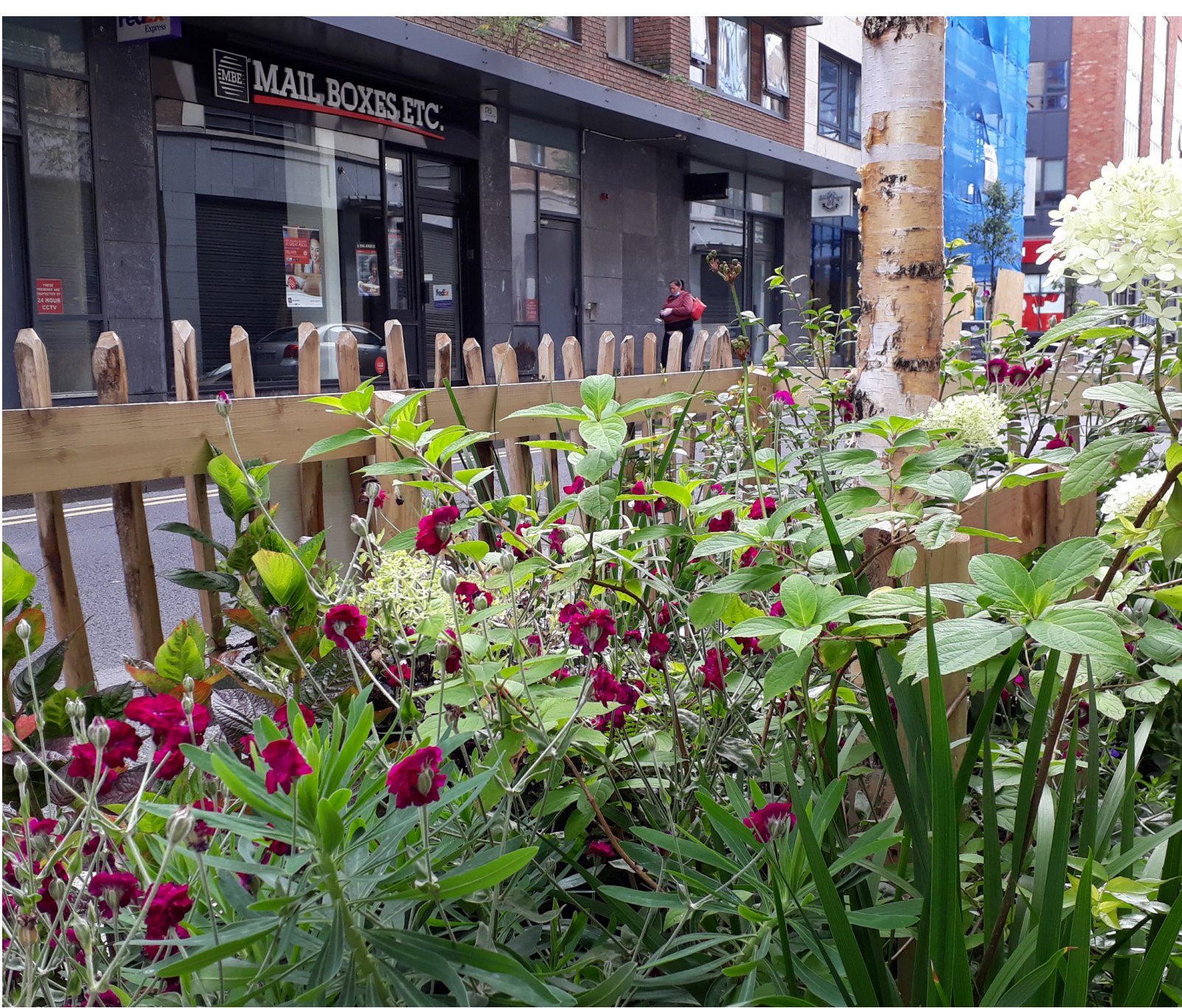
Street Greening, James Joyce Street

The North East Inner City Greening Strategy was initiated by Dublin City Council, working closely with DCC Parks, Biodiversity & Landscape Services and the North East Inner City Area Office; Áit U+L, who were commissioned to work in collaboration with the in-house DCC team, undertook an extensive process of on street analysis and a review of proposed plans and relevant case studies to compile a baseline snapshot of the North East Inner City's public realm and existing green spaces.