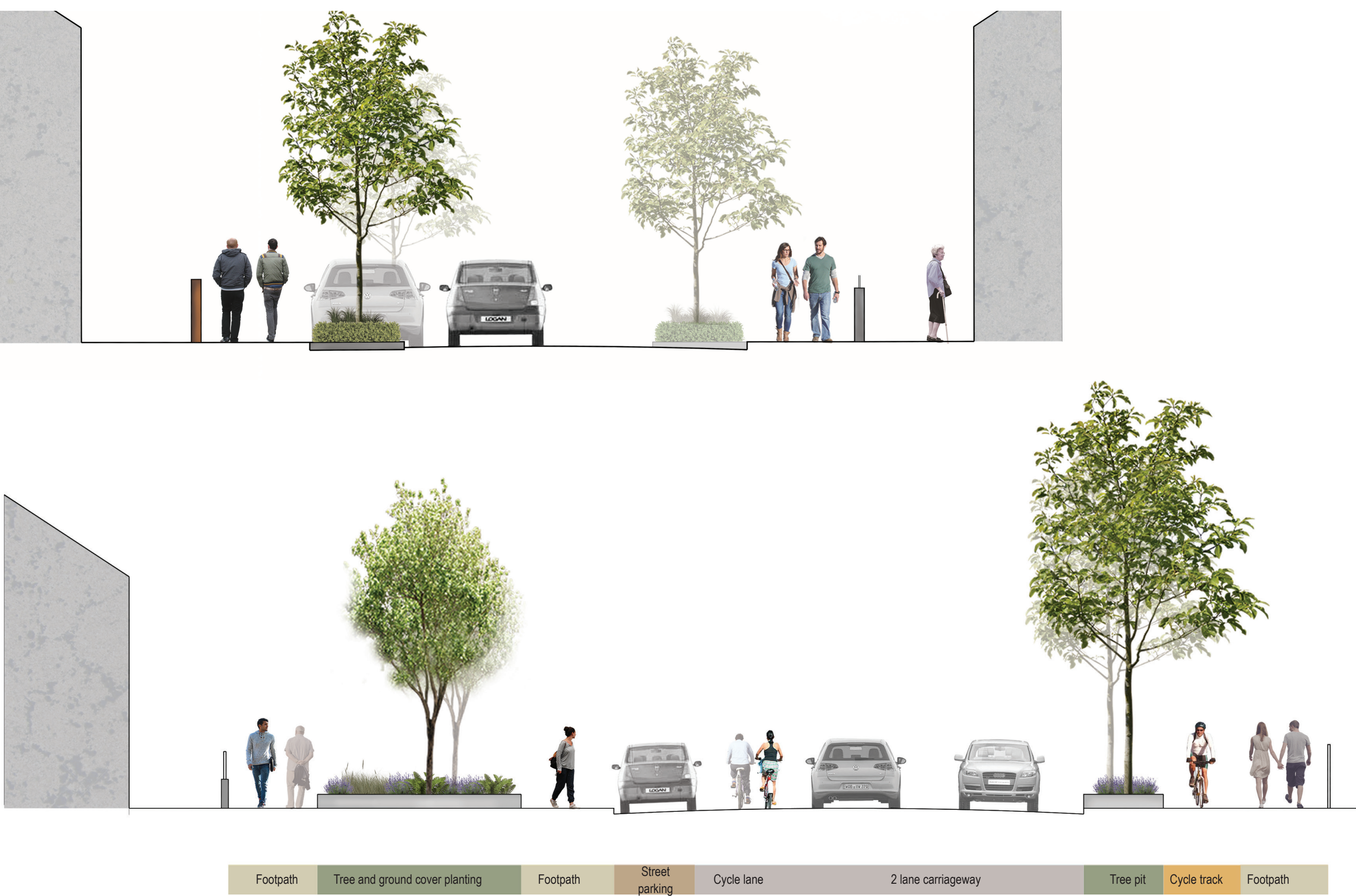
Typical Street Greening Sections