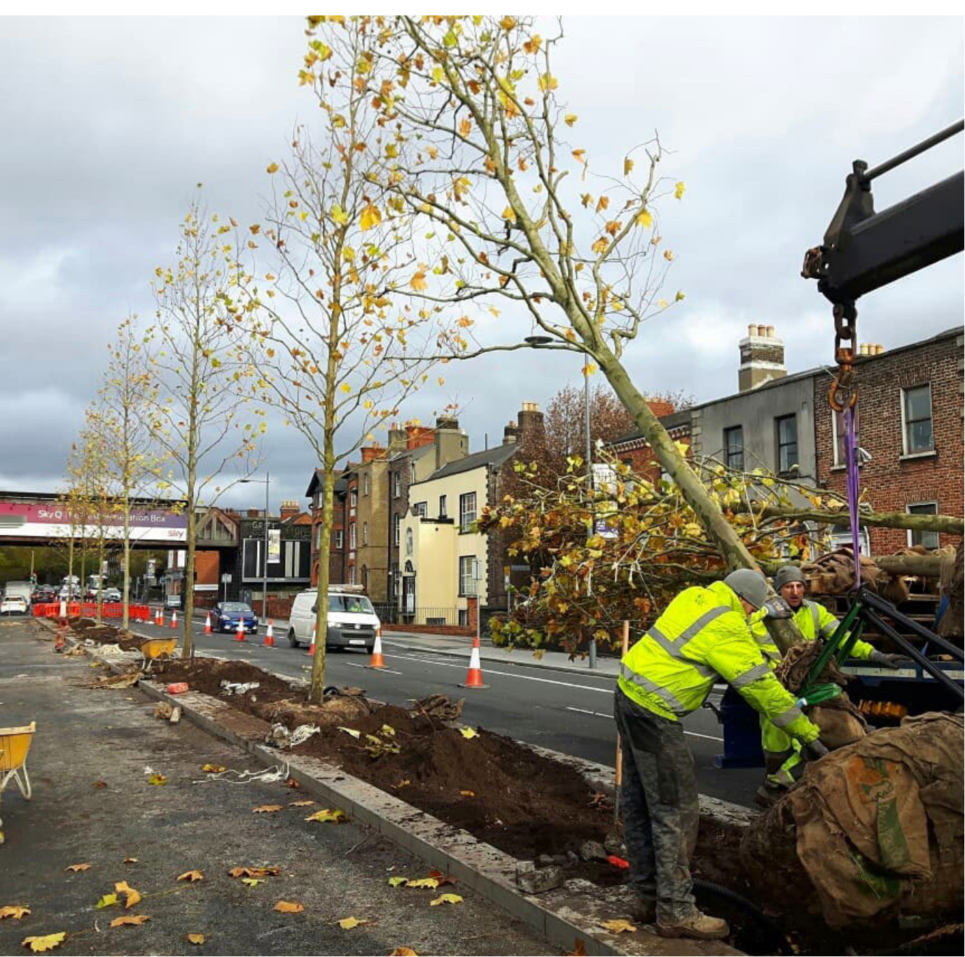
Greening Central Median Strip, Drumcondra Road