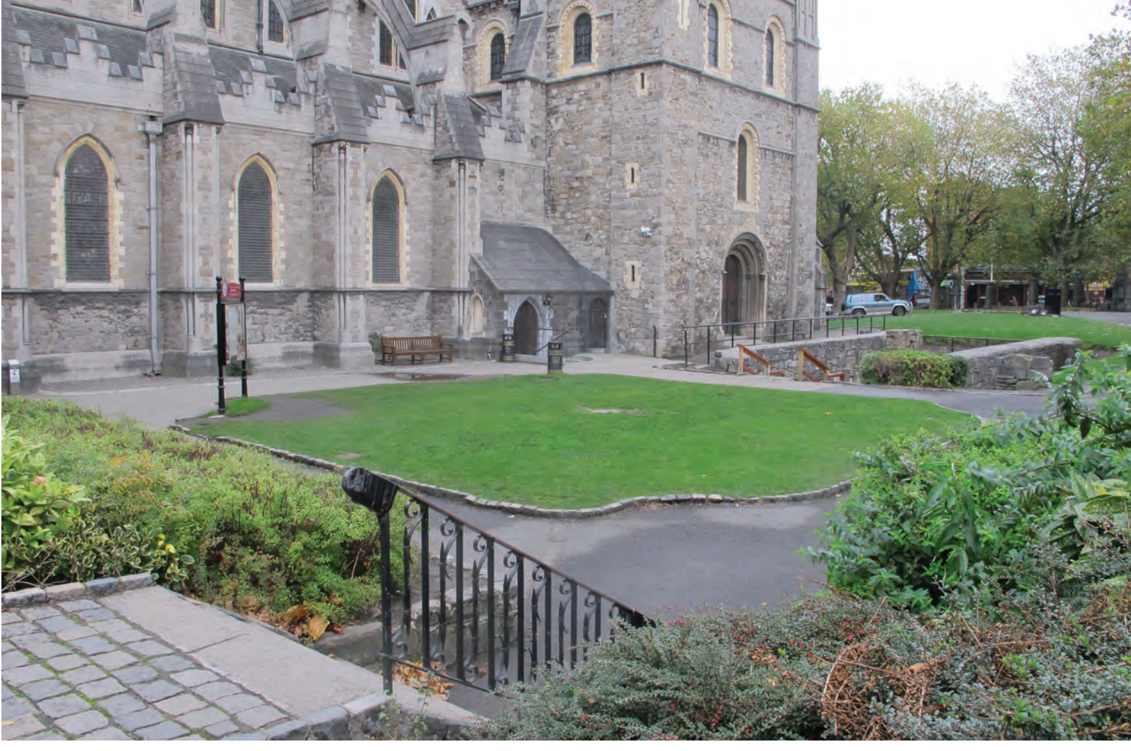
Christ Church Grounds 2016

This phase of the works completed in November 2019.