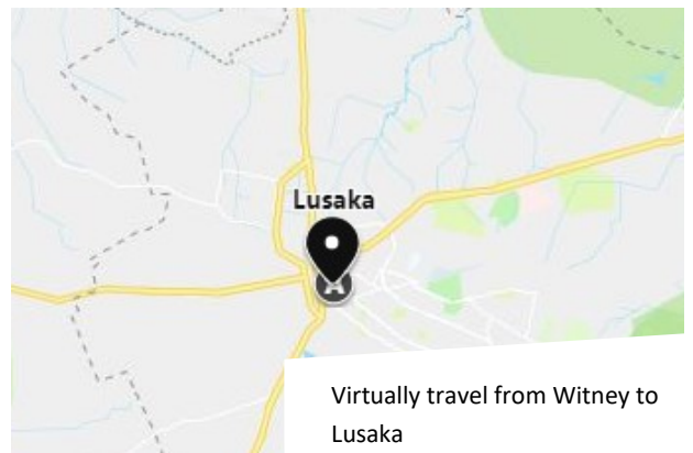
Virtually travel from Witney to Lusaka