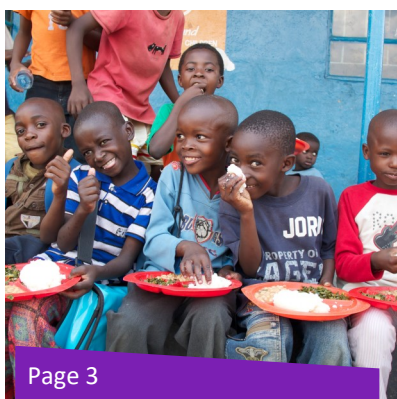
Page 3 Christmas Appeal Update!