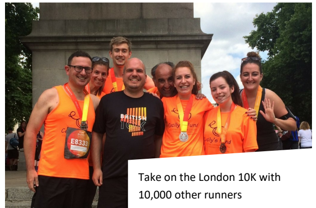
Take on the London 10K with 10,000 other runners

For over a decade, Cecily's Fund runners have raised thousands at the London 10K; in 2021 we still have places available for this run, which is one of the UK's very best and takes in many of the capital's iconic sights. Contact us for more info and to sign yourself up!