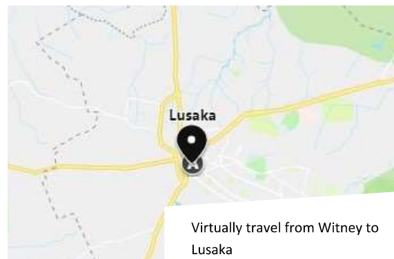
Virtually travel from Witney to Lusaka