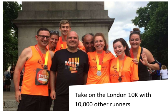
Take on the London 10K with 10,000 other runners

For over a decade, Cecily's Fund runners have raised thousands at the London 10K; in 2021 we still have places available for this run, which is one of the UK's very best and takes in many of the capital's iconic sights. Contact us for more info and to sign yourself up!